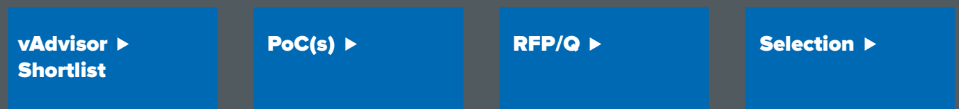
Net Reply's Solutions Evaluation Framework